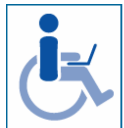
Adaptive Technology Computing Site

Location: Room B-136, Ground floor, Shapiro Undergraduate Library