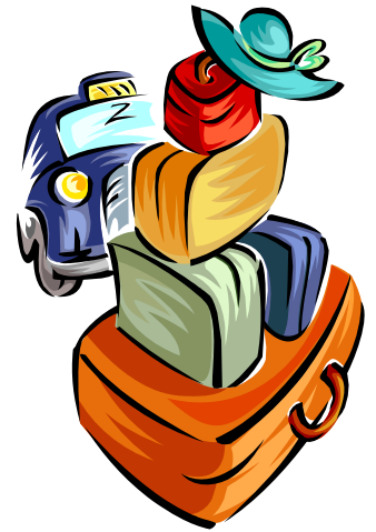
Students can take airBus when traveling to and from the airport.

If you (or one of your students) needs to get to the airport at a time other than an official University break, there are many shuttle companies who can take you there (but be warned, the trip will cost more than $10). From the CIC website ( http://www.umich.edu/info/ ), click on the link that says "Airport" at the bottom of the left-hand column. Then click again on the link that says Ann Arbor Convention Visitor's Bureau to be taken to a list of airport transportation options.